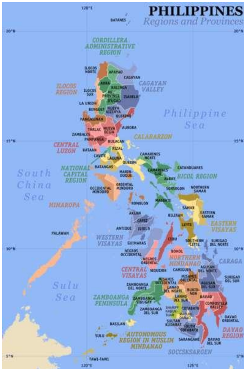
Figure 1: Republic of the Philippines